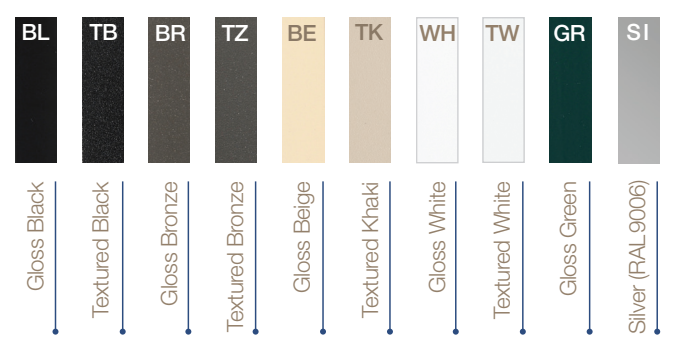
Colors shown represent an approximate comparison and may vary slightly from actual product color.

Our special Ultra Powercoat<sup>™</sup> finish is resistant to harsh weather and heat.